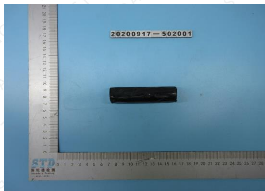
Fig1.The picture of sample